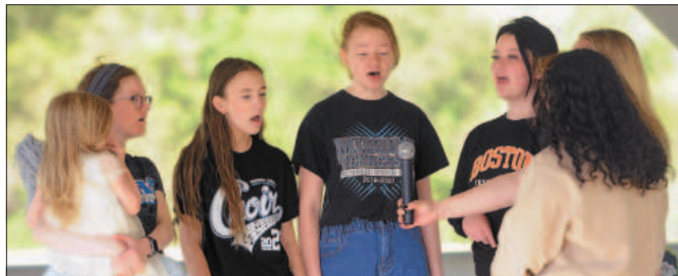
Members of the Marshall County High School choir sing the national anthem as part of the opening ceremony in Saturday's Olympic Games.