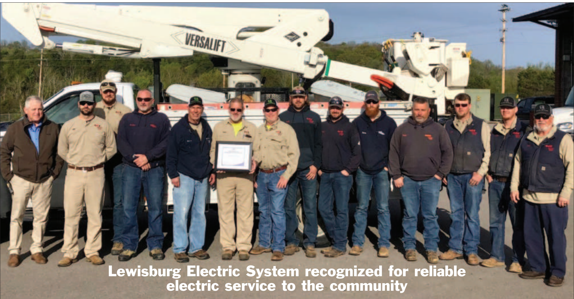
Lewisburg Electric System recognized for reliable electric service to the community