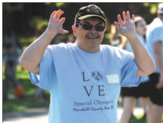
Excitement was in the air as the first Special Olympics in three years was held on Saturday at Westhills Elementary.

The Marshall County Olympians will join thousands from across the state in competition and with the coaching and support staff, Poarch has