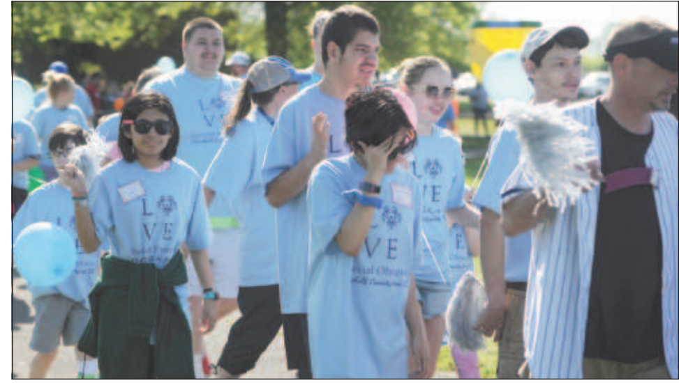
Participants in the Special Olympics wave at spectators as they make their way through the parade.