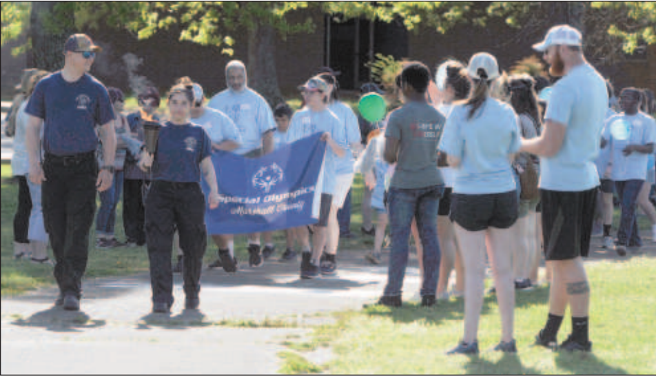
Athletes who participated in the Special Olympics of Marshall County on Saturday make their way, led by the Olympic flame, in the parade of contestants.