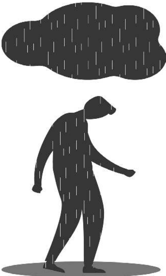
This image is for editorial use only. Not to be used in any advertising.

• Lack of physical activity: A 2019 study from the Harvard T.H. Chan School of Public Health found that running for 15 minutes a day or walking for an hour reduces the risk of major depression. That link is likely connected to the release of endorphins triggered by exercise. Endorphins are hormones that studies have shown contribute to a general feeling of well-being, which explains why a lack of physical activity can adversely affect mood. • Chronic stress: Chronic stress has long been linked to a host of health problems. According to the Mayo Clinic, chronic stress puts individuals at increased risk for heart disease and weight gain but also issues that affect mood, including anxiety and depression. Individuals who find themselves routinely confronting bad moods may be dealing with chronic stress. Identifying the source of that stress and speaking with a health care professional about how to reduce and manage it may lead to improvements in mood. • Hunger: A 2018 study from researchers at the University of Guelph in Ontario found evidence that a change in glucose levels can have a lasting effect on mood. The study, published in the