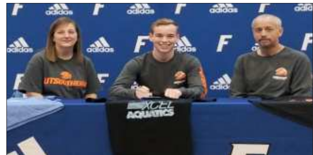
Milligan picks college destination