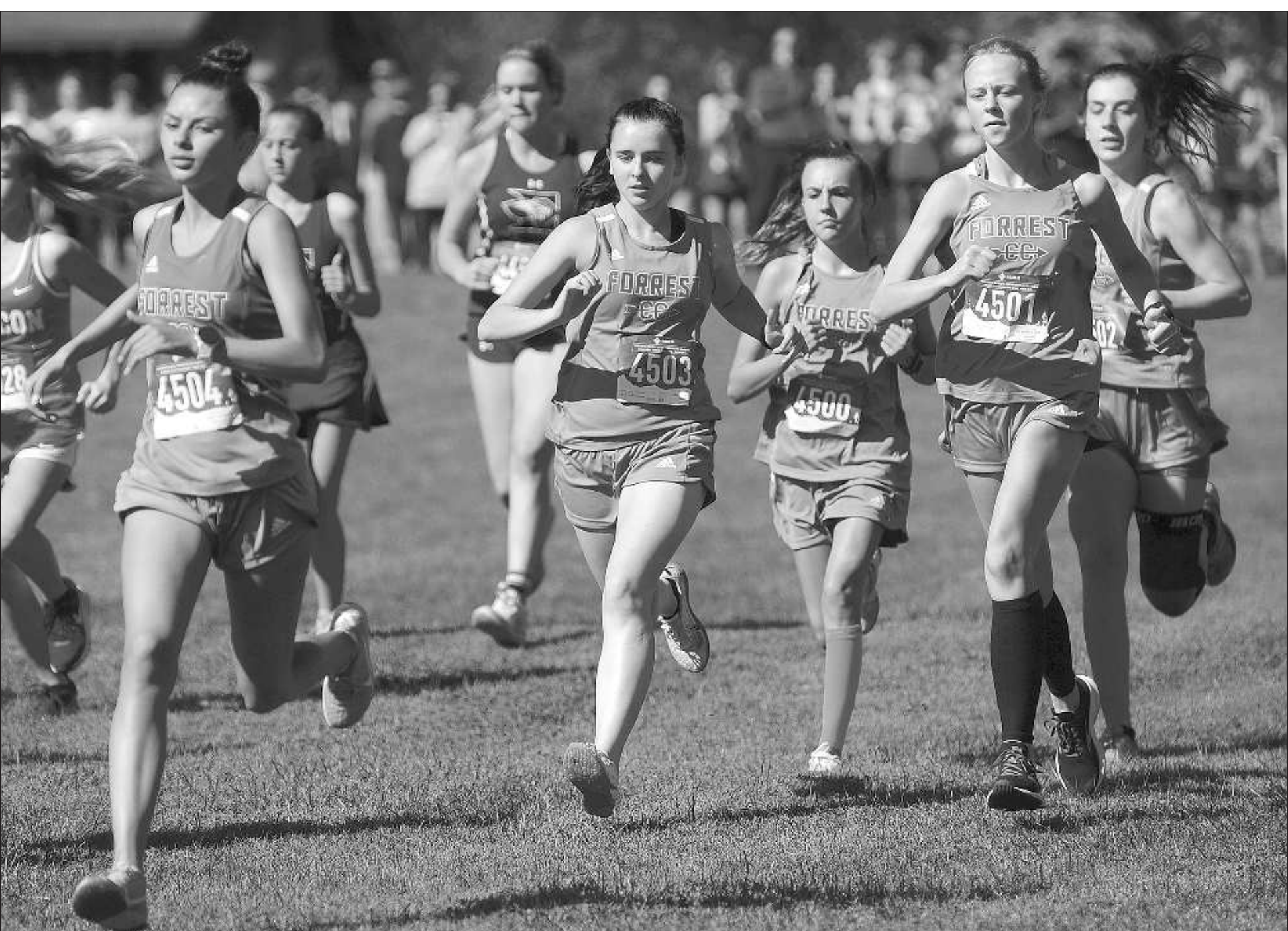
The Forrest Lady Rockets sprint and fight for position after the start of the Region 4A-AA meet.