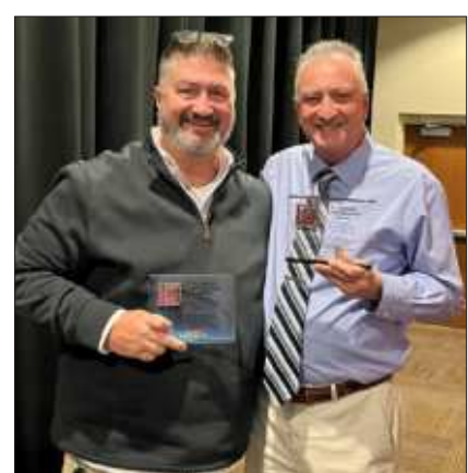
County AD, former sports editor honored