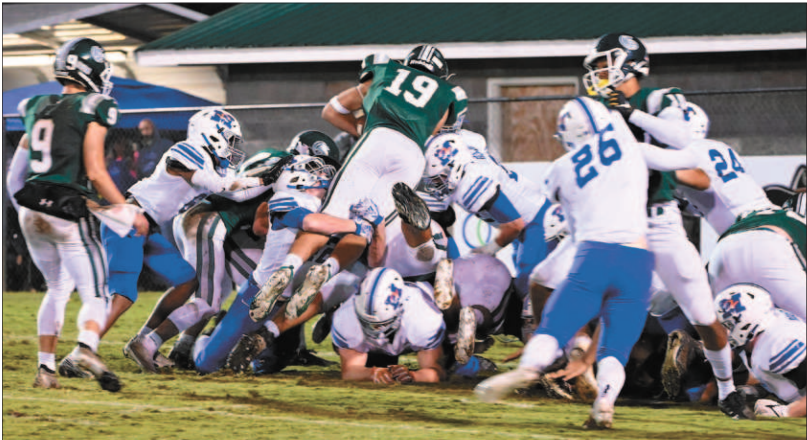
The Marshall County defense crashes at the line and forces a goal line stand against Greenbrier.