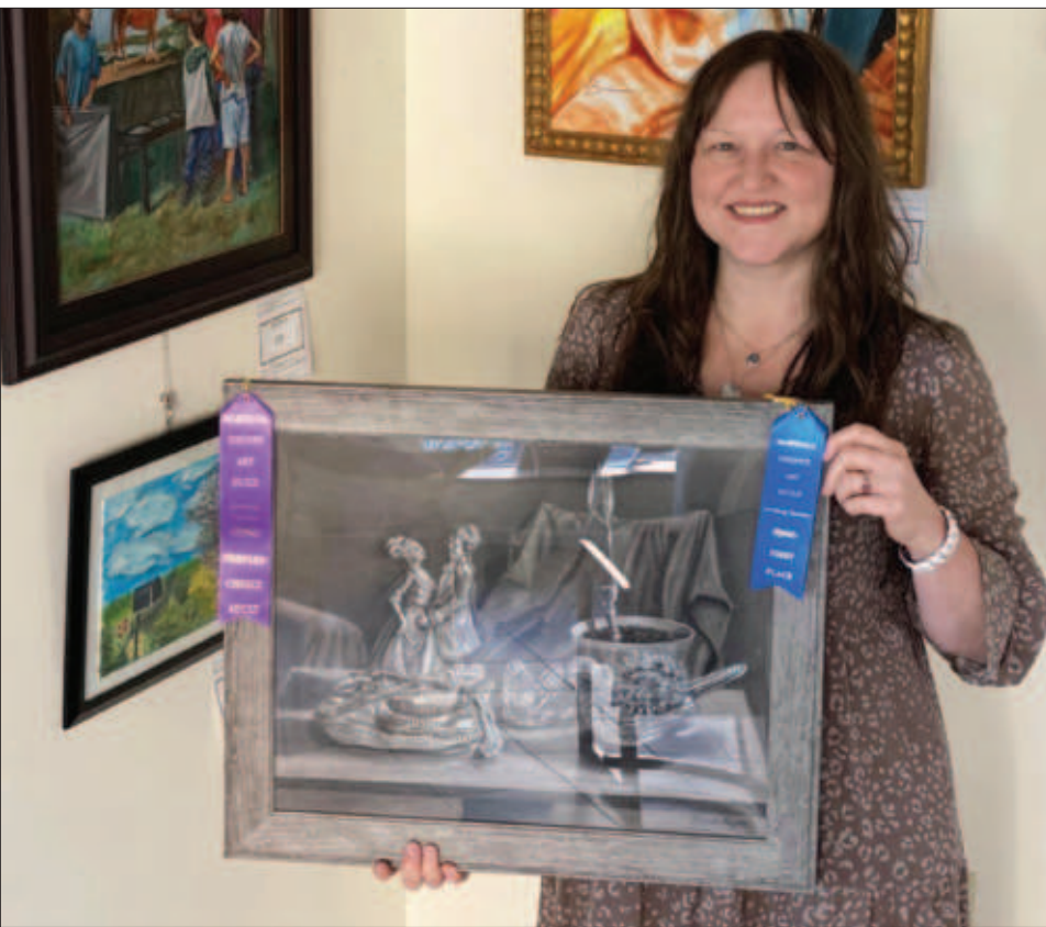
MCAG People's Choice: Brandie Liggett (adult division) for "Hope Feathers" (charcoal drawing)