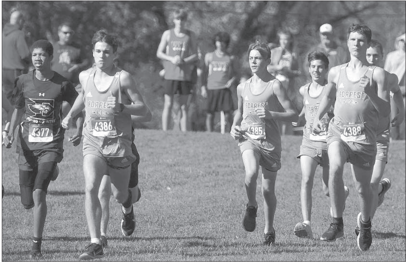
The Forrest Rockets fight for early position after the start of the Region 4A-AA meet at Henry Horton.