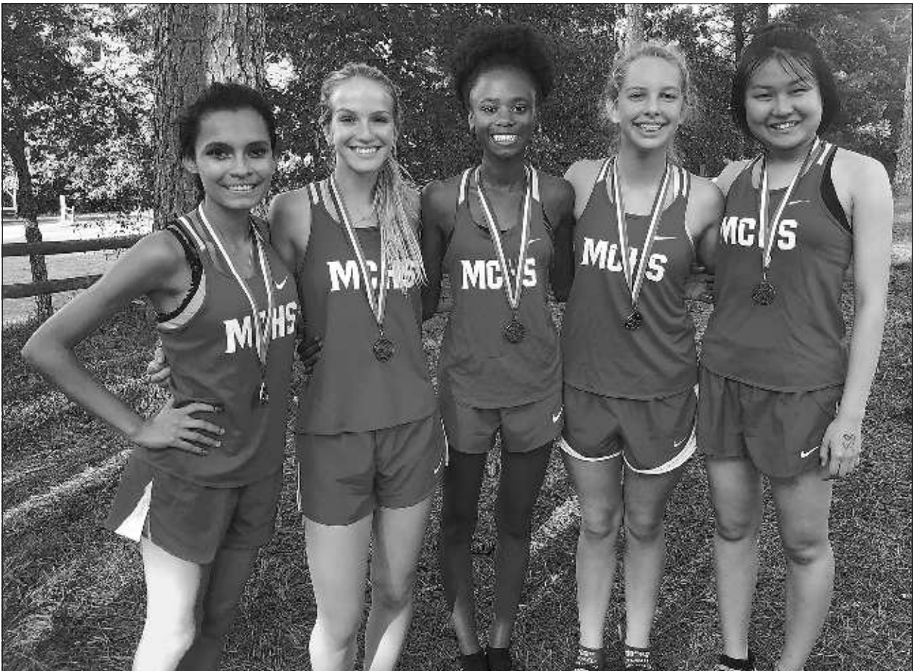
Several members of the Tigerettes cross country team pose with their medals following Thursday afternoon's meet in Fairview.