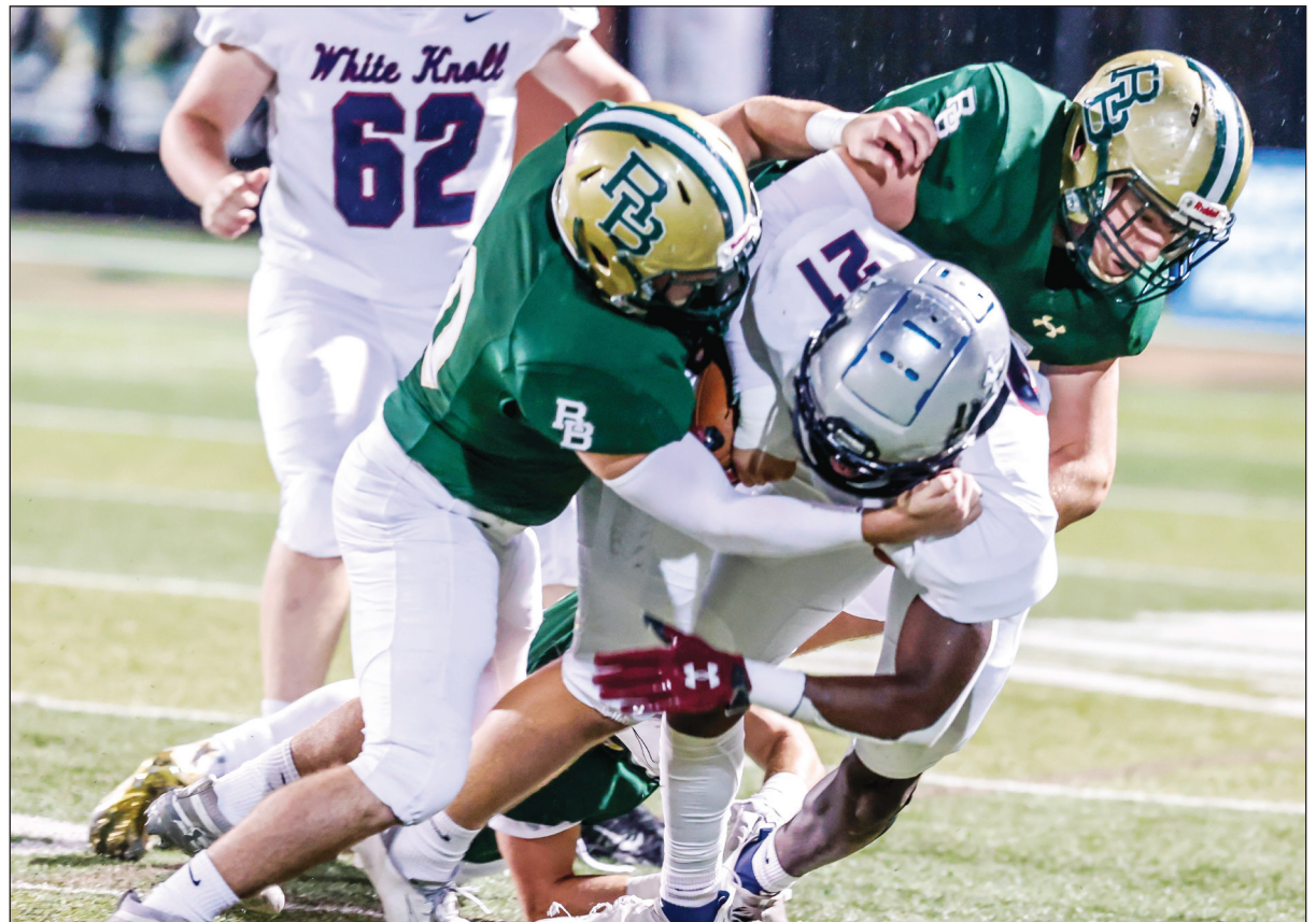
River Bluff players team up for tackle against White Knoll.