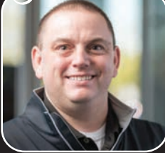
LEN WALL OF JIM HUDSON TOYOTA