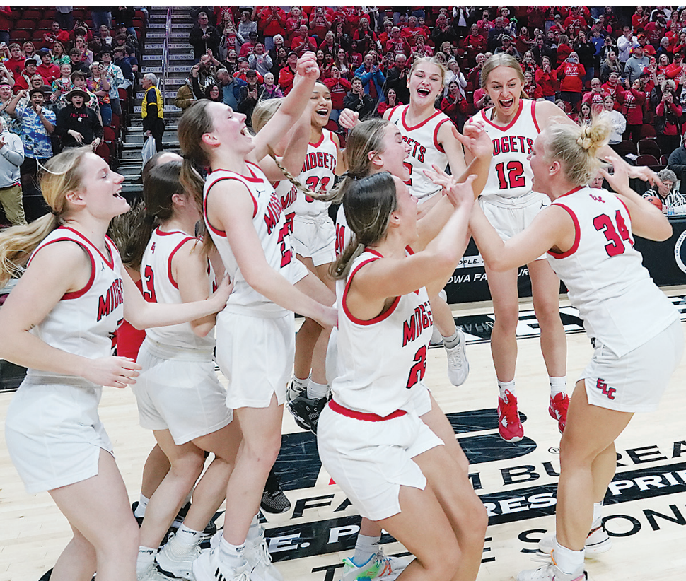
ELC players celebrate their Class 3A State semifinal victory over Mount Vernon.