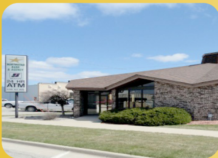
Estherville Downtown Drive-Thru