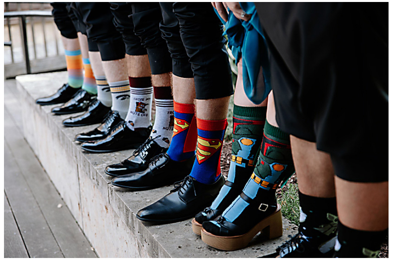
The bridal party had a lot of fun by wearing fun and colorful socks to the wedding.