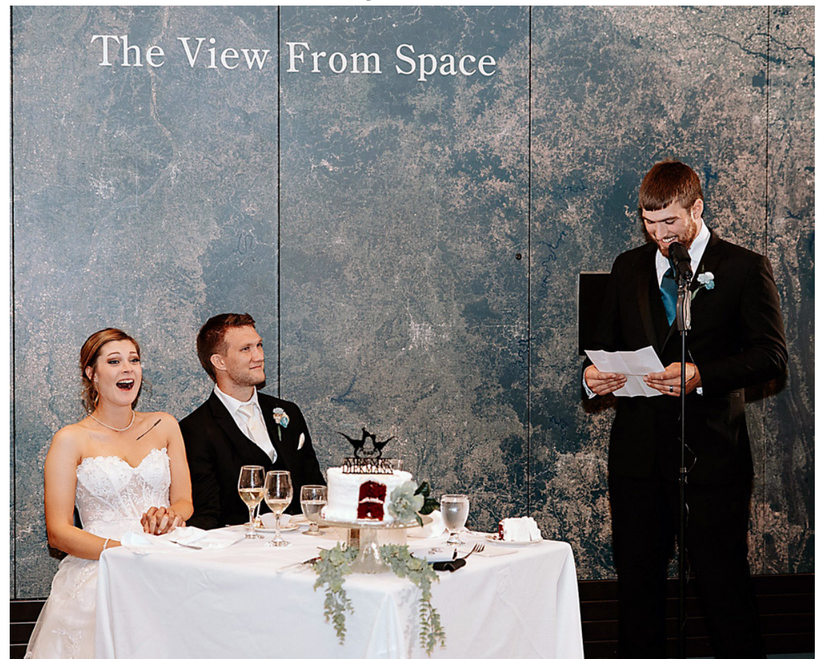
You never know what will be said in the speeches given by those in the bridal party.