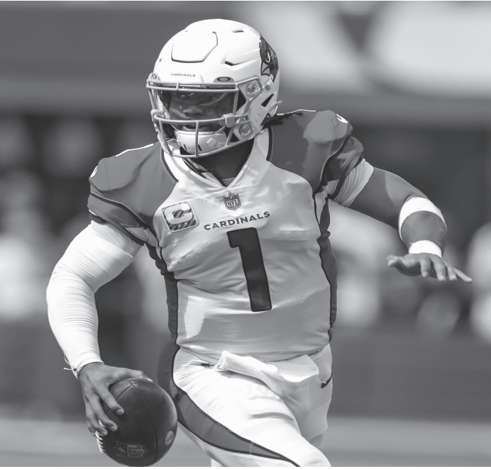
Kyler Murray leads the Arizona Cardinals against the Los Angeles Rams Monday on ESPN.