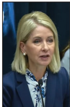
Rep. Mary E. Miller