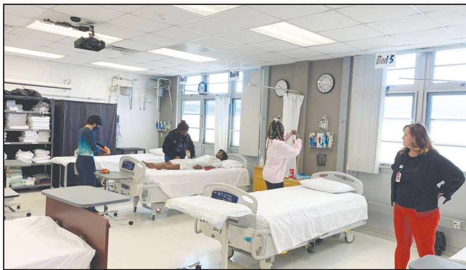
Students at Orange Park High's Career and Technical Education program get skills training in Emergency Medical Responders and other Health Science-related fields, while students can learn automotive skills from Garber Automall at Middleburg High.