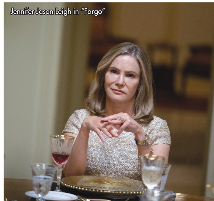
Jennifer Jason Leigh in “ Fargo ”

of action, Dot is pursued by North Dakota Sheriff Roy Tillman (Jon Hamm, “ Mad Men ”), Deputy Witt Farr (Lamorne Morris, “ New Girl ”) and a mysterious man named Ole Munch (Sam Spruell, “ The Martian, ” 2015).