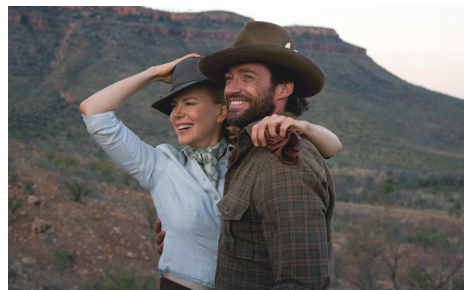
“Faraway Downs” (Hulu — Nov. 26, Limited Series Premiere)

The story centers on an English aristocrat, Lady Sarah Ashley (Nicole Kidman) who travels halfway across the world to confront her wayward husband and sell an unusual asset: a million-acre cattle ranch in the Australian Outback called Faraway Downs. When a ruthless Australian cattle baron, King Carney (Bryan Brown), plots to take Lady Ashley’s land, she reluctantly joins forces with a rough-hewn cattle drover (Hugh Jackman) to protect her ranch. The sweeping adventure romance is explored through the eyes of young Nullah (newcomer Brandon Walters), a bi-racial Indigenous Australian child.