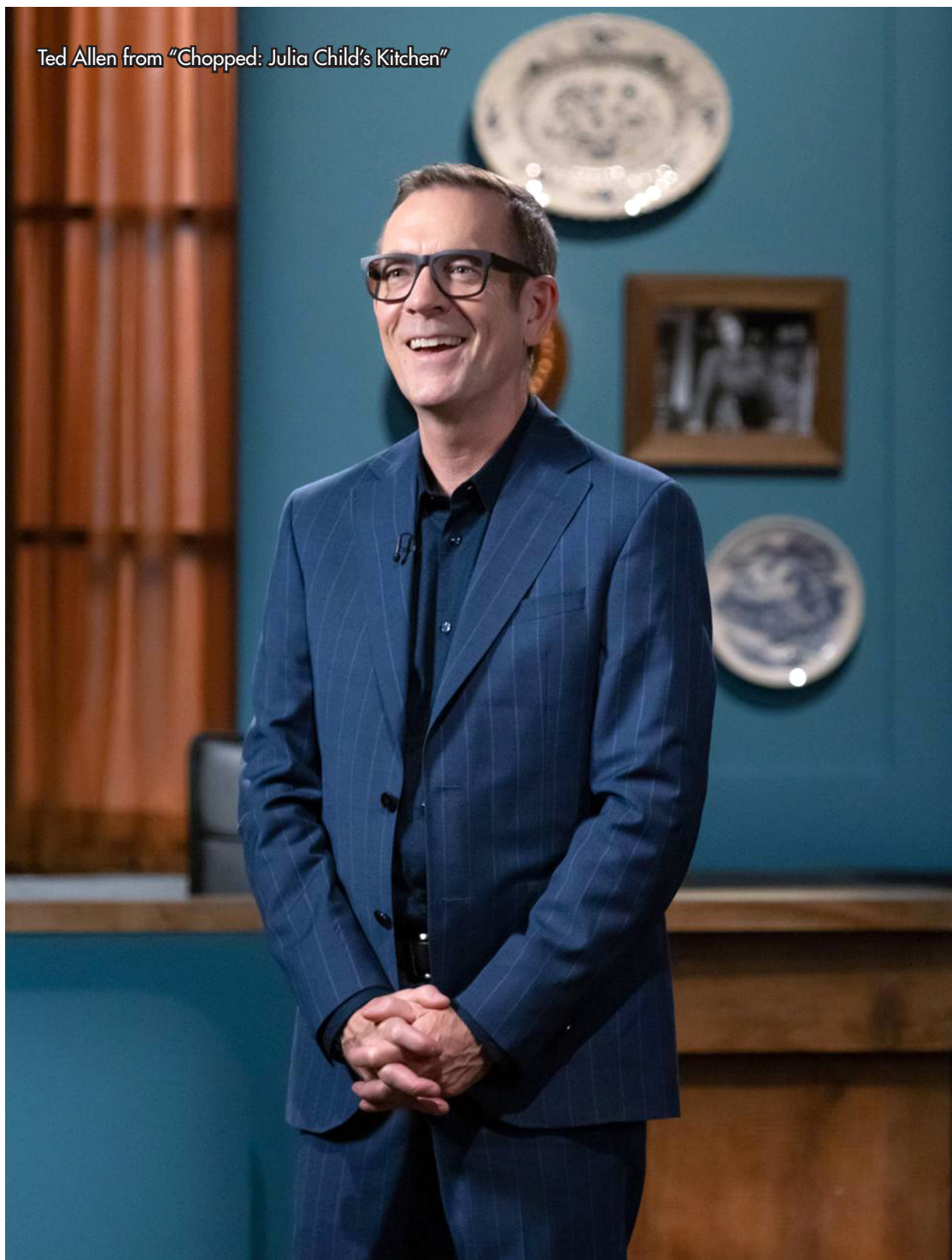
Ted Allen from "Chopped: Julia Child's Kitchen"

As the chefs continue their journeys to France — and practice their accents — "Chopped: Julia Child's Kitchen" premieres an all-new episode, Tuesday, Nov. 21, on Food Network.