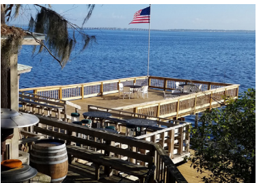
View of the deck at The River House.

2137 Astor Street, Orange Park, FL (904) 269-5050 theriverhousebarop@gmail.com